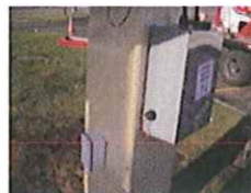
Radio on Sign at least 2.5' away from other antennas