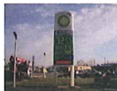
Face – Side 2