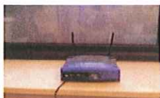
Radio in Store at least 2.5' away from other antennas