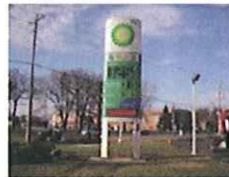
Face – Side 1