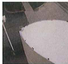
Top of Sign